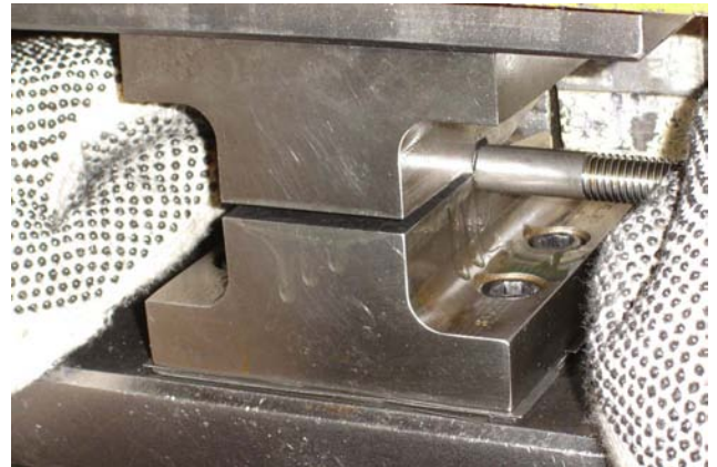
Cable end being swaged on 5/16" wire rope

SVI provides the auto lift industry's lowest pricing on cables.